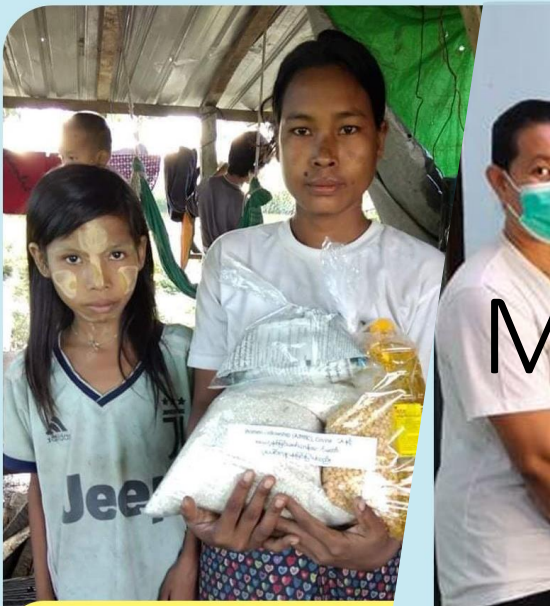
Donated by ICFLC