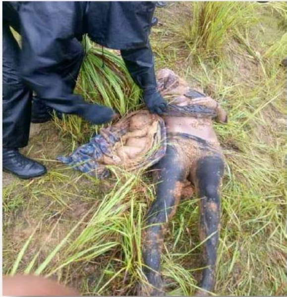
women and children are victims of this flood disaster