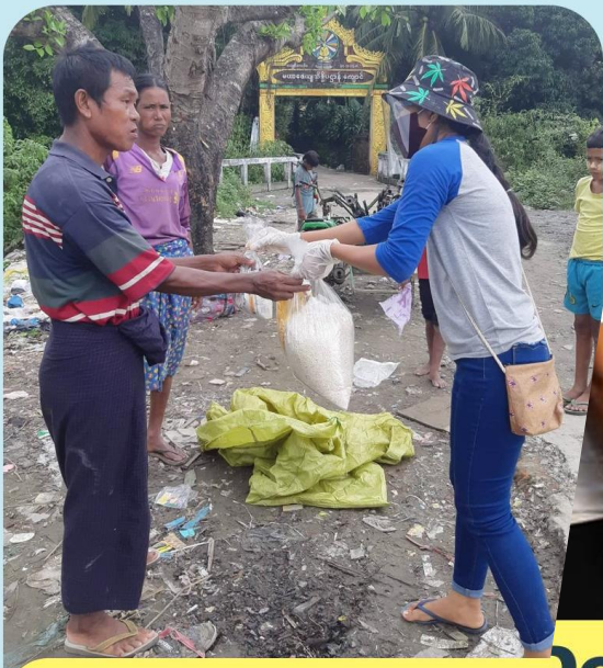
Donated by ICFLC