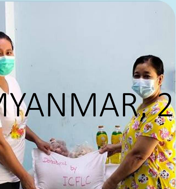
Donated by ICFLC