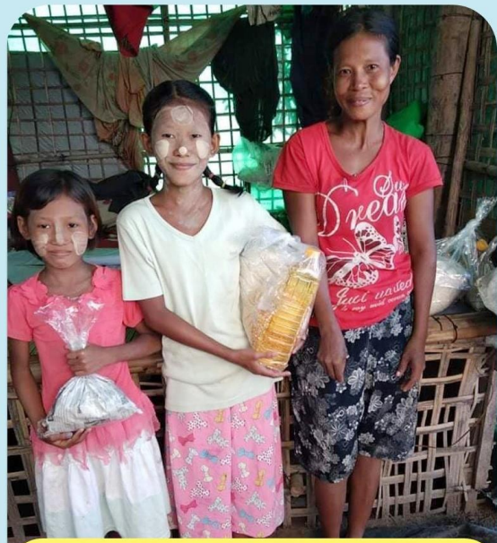
Donated by ICFLC