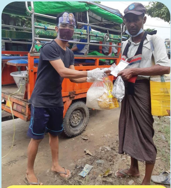
Donated by ICFLC