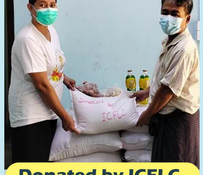
Donated by ICFLC