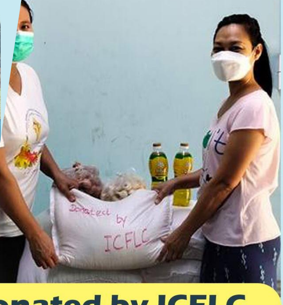
Donated by ICFLC