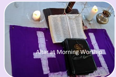
Altar at Morning Worship