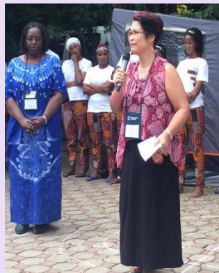
The FLC, A Poem