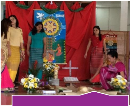
Centering for worship, by AWIT women