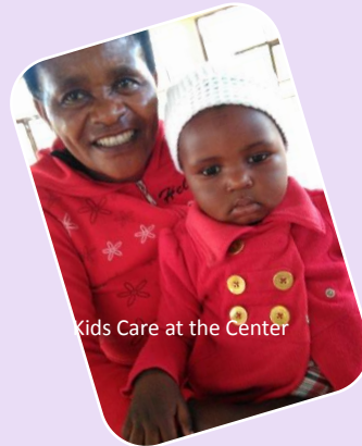
Kids Care at the Center