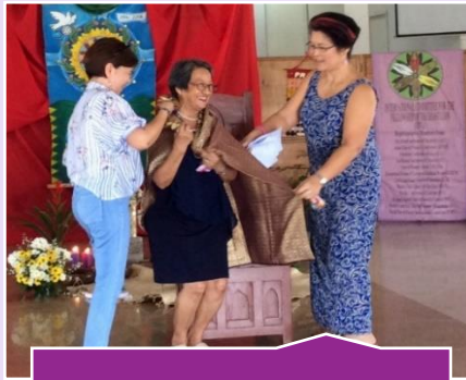
Bestowing the Cloth of Wisdom, from NCC Philippines