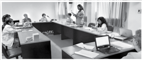
2019-2022 ACWC Executive Committee: more than one third are young women.