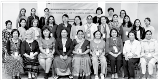
EWAAV in Bangkok, Thailand

Regional Consultation on Ecumenical Women's Action against Violence (EWAAV), 15-17 November 2018/ Bangkok, Thailand, on the theme 'Transforming the World and Building Peace' held at the YWCA in Bangkok, Thailand. The Consultation was the third in a series of annual regional consultations organized by CCA as part of a new programme initiative – Ecumenical Women's Action against Violence (EWAAV). Follow up programmes also took place in Cambodia, Pakistan and India.