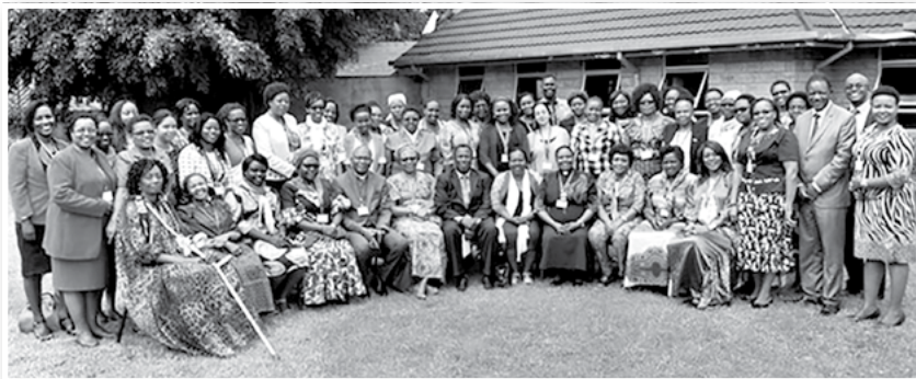
Women participants trained on entrepreneurship at the DTCC Nairobi-14-18 May, 2018

Women and Youth Sensitization Forum on Entrepreneurial Culture for Self-sustainability and Wealth Creation, in Nairobi, Kenya, 14-18 May 2018; Lomé, Togo, 26 to 30 November 2018.