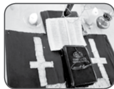
Altar at Morning Worship