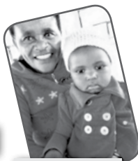
Kids Care at the Center